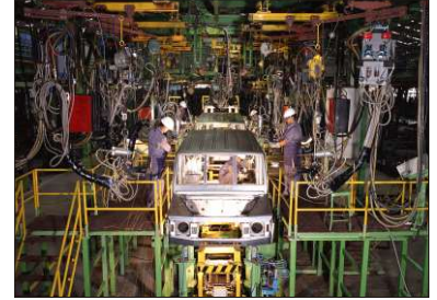
Body Welding Fixture