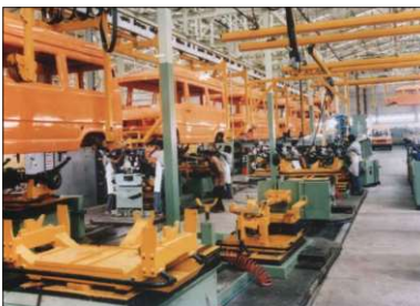
Body Aggregate Line