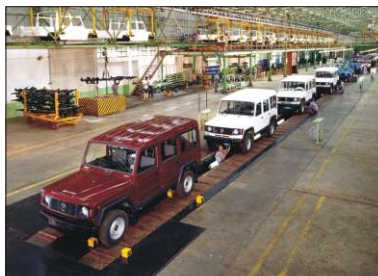
Final Assembly Line