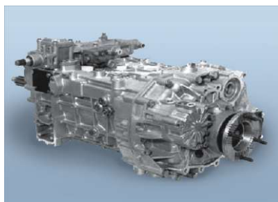
S9 - 1300