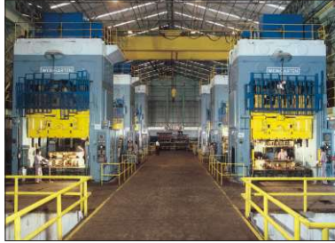
Press Shop Line